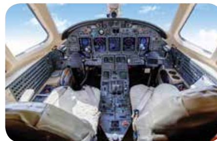
Cockpit of a Citation 750

In crosswind landings, you cannot put a wing down to stop the drifting or it will scrape the runway, so a technique many use is to keep the crab in until just before touchdown, then center the airplane to the runway with rudder, but keep a reasonable sink rate going for a smooth touchdown thanks to trailing link gear.