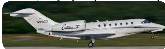
Citation 750, SN-239 is the airplane I flew for several years - D. Moll

I flew the 10 for many years and it was without question the best airplane I've flown in my career. It was extremely reliable, very comfortable, and yes, it was very fast. Normal flight planning was for 500-510 knots. The fastest ground speed I had was a true airspeed of 525 knots, combined with a 200 knot tailwind, making our ground speed 725 knots or 833 mph.