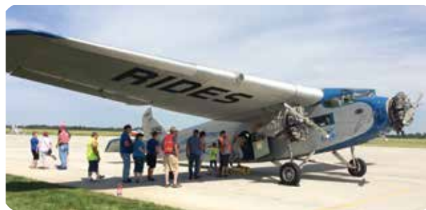
Ford Tri-Motor Loading Passengers at ONL

The EAA Ford Tri-Motor tour made a scheduled stop at O'Neill Nebraska June 14th thru 17th. Even though it was hot and windy the attendance was fantastic flying 43 flights carrying about 350 passengers.