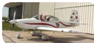
A beautiful Vans RV-9A

heat, wind and the forecast of possible storms, somewhat less than expected fly-in pilots showed up. Nevertheless, 60 pancake breakfasts were served.