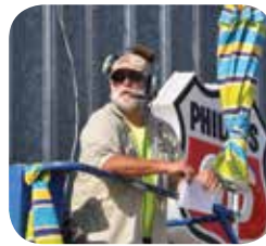
Air Boss 2

Smith were busy keeping the performances safe from any other air traffic while coordinating the airshow itself.