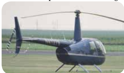
Larry Geigers Beautiful Robinson

provided by the local Optimist Club. Later in the day a downtown parade was held in conjunction with Auroran Days. Another fine fly in breakfast for the state of Nebraska.