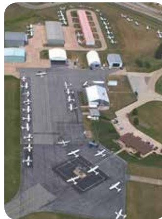
Air Race Classic Planes Parked at BIE

In case you don’t know what the Air Race Classic is, it’s an annual transcontinental air race for female pilots. Route lengths are approximately 2,400 statute miles. All flights are conducted in day visual flight rules conditions.