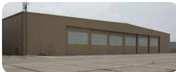
New Silverhawk Hangar at LNK

Silverhawk Aviation has completed its newest hangar at the Lincoln Airport. The project began last September, and the 30,000 sq ft structure, which can accommodate aircraft up to a Falcon 2000, brings it to a total of 80,000 sq ft of hangar space.