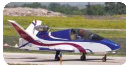
Tom Larkin & his SubSonex Mini Jet

EAA Young Eagles rides were being given (nearly 60 for the day) while helicopter rides, and tandem parachute jumps were taking place. And yes, there were air show aircraft such as Doug Roth's Staudacher "Super Star", a 350hp fully aerobatic monoplane, Tom "Lark" Larkin's SubSonex Mini Jet (300mph weighing 500lbs) and Curt Muhle's Vultee BT13, the "Vultee Vibrator." During WWII contract pilots trained new pilots in the Piper Cub at Chadron and then in the Vultee BT13. 11,500 Vultee's were built but today there are only about 30 still flying.