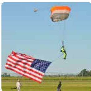
Chris Holland With Flag

Wow! The weather was perfect with blue skies and mild north winds. American Legion Lone Tree Post 6 posted the colors while Chris Holland of the Lincoln Sport Parachute Club (LSPC) came in with our Flag streaming through the air. Four members of the LSPC did two jumps