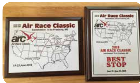
Beatrice was named “Best Stop” of the Race

surfaces, which the guys started first thing Wednesday morning. Everyone seemed to take it in stride and made the best of all of the issues that were thrown at them!! Beatrice Airport and the City of Beatrice was very fortunate to have all of the gals land at BIE, wishing the weather would not have been an issue for them!!! It was a great Economic Impact for City of Beatrice and also a super experience for Beatrice Airport!!! These pilot teams surely