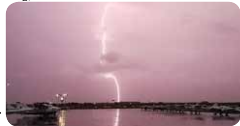
Not even the Ducks were flying in this WX

We all felt so bad since Tuesday night we received over 4 inches of rain, making the ground very wet and miserable to move aircraft out of the grass to the hard