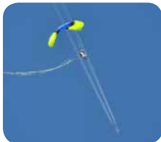
Rod Floerchinger Between Contrails

Attendance at the breakfast totaled 325 for a great meal of pancakes, sausage and scrambled