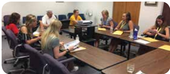
Learning how the Division of Aeronautics works

On June 7, the NDOT – Division of Aeronautics again had the privilege of being part of a wonderful program called American Legion Auxiliary Girls State. This event is one of the most respected and coveted learning programs presented across America. Young