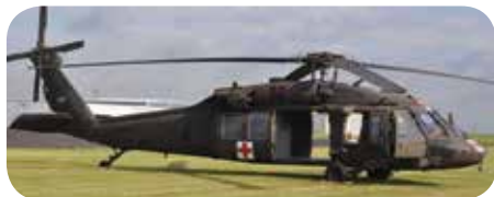
National Guard Blackhawk

flew in the Reno Air Races last summer. The turbine Legend is one go-fast airplane, clocking in at 275 knots at 18,000 feet. While the Glassair III qualified at Reno with a very impressive 248 knots in the Sport Class.