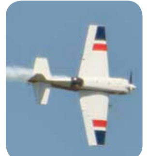
Doug Roth's Staudacher

EAA Young Eagles rides were being given (nearly 60 for the day) while helicopter rides, and tandem parachute jumps were taking place. And yes, there were air show aircraft such as Doug Roth's Staudacher "Super Star", a 350hp fully aerobatic monoplane, Tom "Lark" Larkin's SubSonex Mini Jet (300mph weighing 500lbs) and Curt Muhle's Vultee BT13, the "Vultee Vibrator." During WWII contract pilots trained new pilots in the Piper Cub at Chadron and then in the Vultee BT13. 11,500 Vultee's were built but today there are only about 30 still flying.