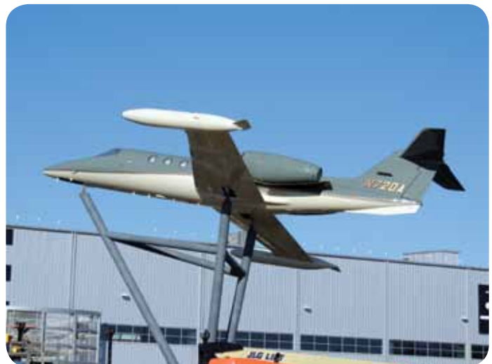
New Parking Lot Fixture: LearJet N72DA

As Duncan Aviation's locations continue to grow in size and number, the company looks to expand into even more capabilities and new global markets.