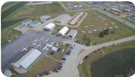
Beatrice as the airplanes started arriving

and Scottsbluff with 49, including a Gulfstream 450. Based on the number of pilots calling in to both the Alliance and Beatrice airports, the FAA set up temporary control towers at these