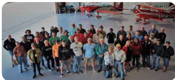
Some of the pilots and volunteers that make the Midwest Aerobatic Championships a success