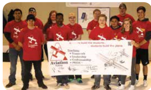
Mentors build the students, students build the airplane