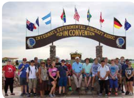
A field trip to OshKosh