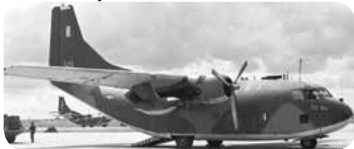
Air Force C-123

The reunion was very well planned, and included tours of the Strategic Air Command & Aerospace