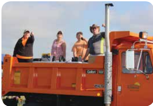
The FAA control tower at Alliance was truly mobile.

Denver Center controller was absolutely the best I've heard in a long time handling this overflow of traffic. He was cool, calm and collected while issuing holding instructions to those who could, or sending them to another VOR for holding or to an airport that was VFR. In the height of the rush, an airplane missed the approach at Scottsbluff. Also, about 10 minutes after our arrival at Chadron, the weather went below IFR minimums. However, as the morning went on, the weather cleared up for good viewing.