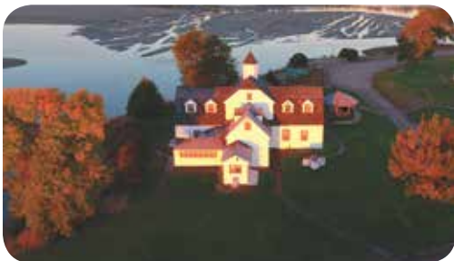
This house photo was taken from a DJI drone.

In the era of a million drones having been sold, is there such a thing as drone privacy? In other words, do you have privacy protection from drones flying over your house? Do we need more laws? Are the FAA Regulations concerning drones only being followed by pilots and not by non-pilots? Would new laws stop people from flying drones over your house even if the Nebraska Legislature passed new laws prohibiting it? Right now there are laws against flying drones near airports, but yet the FAA says sightings of drones near or around airports and other aircraft now exceed 100 reports per month. My point is this: some people really don't care what the law says, and because of that, there is no doubt we could see a patchwork of state laws and local ordinances attempting to regulate drone flying to help control privacy. The "gotcha" in this issue is why do you regulate new technology when it's just the same old criminal activity using a different technique? Window peeping can occur using a drone just as simply as sitting in a tree with a telephoto lens, but you'll never see new regulations on tree climbing and telephoto lenses. At least you can hear the drone and ignore it or react accordingly.