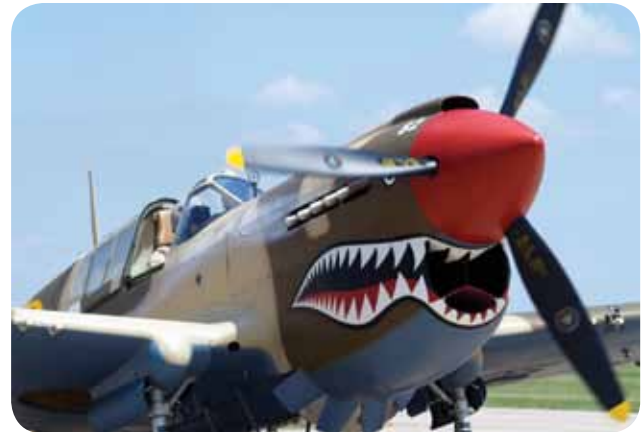
Fagen Group's Restored P-40