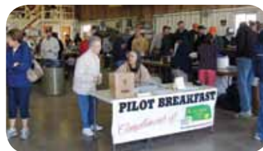
Pilot Breakfast Fellowship

were staring at "Barbara Jean". As the nostalgic smell dissipated after engine shutdown, it was immediately replaced with that of breakfast. Weather was perfect and there was food galore: eggs, sausage, pancakes, and juice were on the menu. It was well-organized and lots of people showed up by driving-in and flying-in. A few helicopters, a pair of matching Christian Eagles, Stearman, Cubs, Cessnas, and Pipers; just to name a few. A variety of airplanes