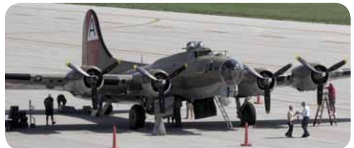
Tours of the B-17