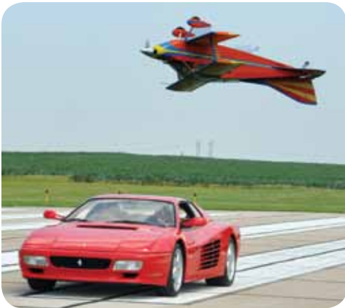
Hyperbype Races Ferrari