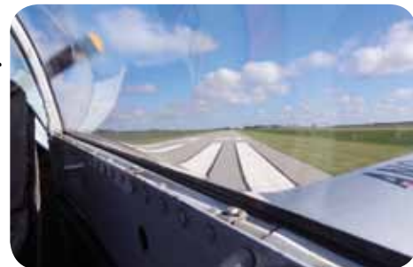
Taking the runway at Central City