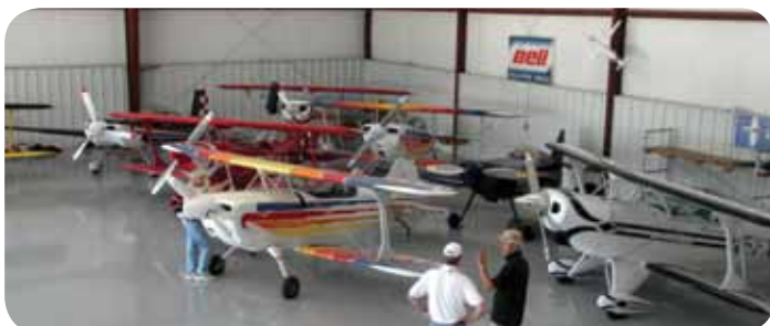
Aerobatic Hangar Stack

The Collings Foundation is a non-profit educational foundation devoted to organizing events that allow people to learn more about their heritage and history through direct participation. The Wings of Freedom Tour travels the nation. Visit www.collingsfoundation.org for more information.