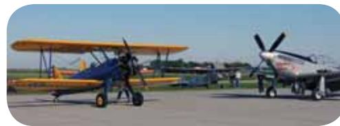
Stearman and P-51

first one". So he did, with a "yee-haw" during the middle of it. Now it was my turn. I did one to the right and then one to the left. The 20-plus-minute flight seemed like it was just under 2 minutes. We landed and taxied to parking. As we taxied, everyone was just staring at us. But let's not kid ourselves; they